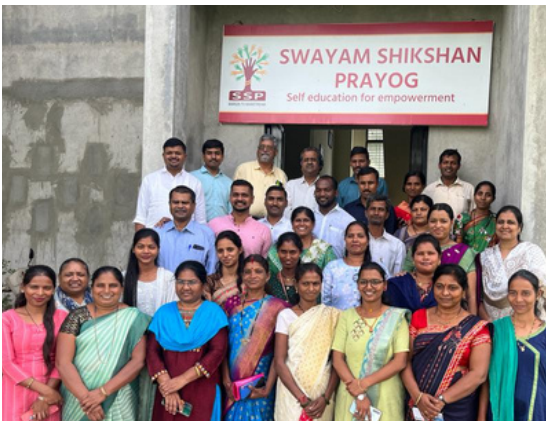
State level CSOs Learning and Advocacy Event organised by SSP in Osmanabad, Maharashtra

Swayam Shikshan Prayog conducted a district-level dialogue workshop on September 16, 2023 at Venniyode in Kalpetta Block of Wayanad District, Kerala on the topic of "Women-Led Climate Adaptive Farming Practices in Wayanad". The objective of this workshop was to learn about existing and new government programmes around farming, how to access them, and strengthen climate resilient farming practices at the local level. The event was attended by officials from the District Industries Centre - Wayanad, Krishi Vigyan Kendra (KVK) - Ambalavayal, Agricultural Infrastructure Fund (AIF), Krishi Bhavan - Kottathara and elected representatives from Kottathara Gram Panchayat. Over 200 women leaders and farmers also participated in the event.