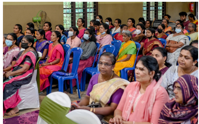
District Advocacy Workshop organised by SSP in Wayanad, Kerala