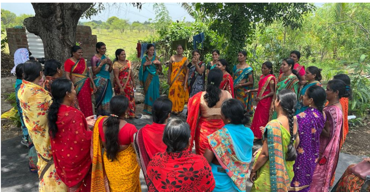
Entrepreneurship Development Program (EDP) Training taking place in Nagarsoga, Maharashtra