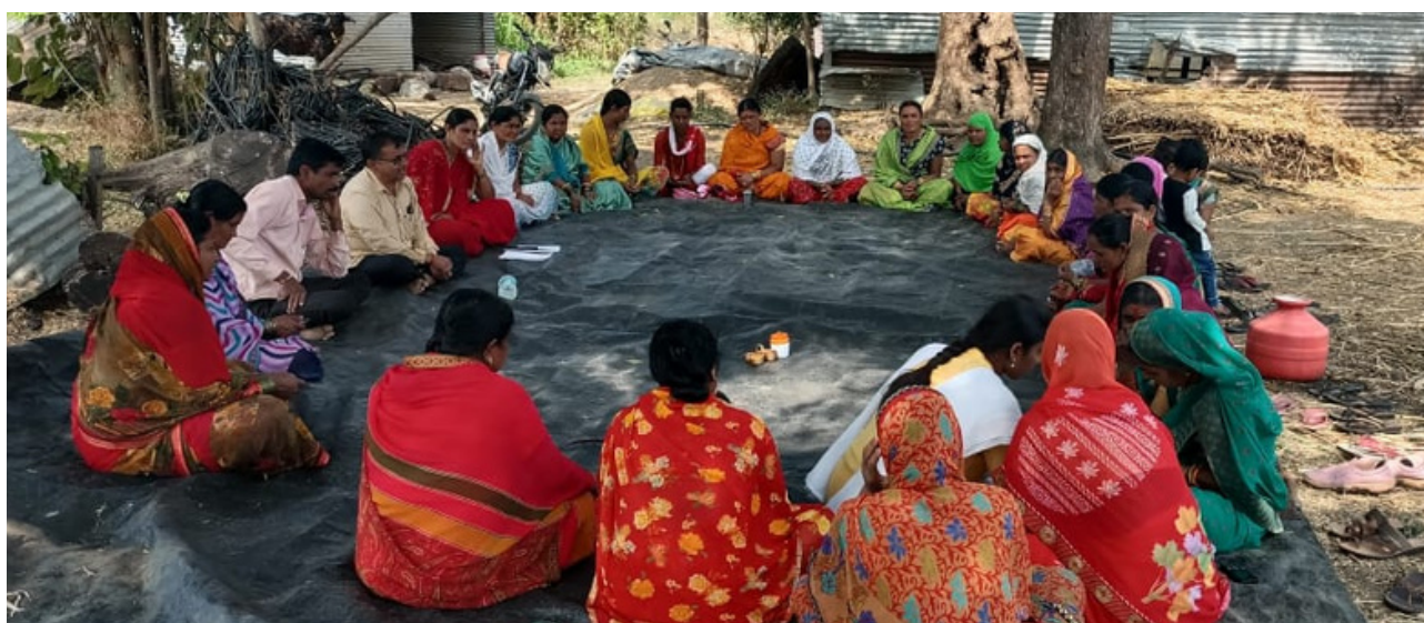
Women leaders in discussion with SSP's team about Value Chain development