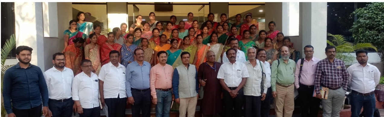
Marathwada District Transformation Model Project Team