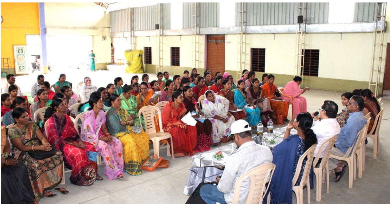
Inauguration of Micro Enterprise Promotion Program supported by SIDBI in Osmanabad