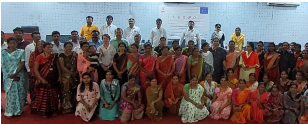
District level value chain strategic workshop with ASIDO, DSS & value chain network members