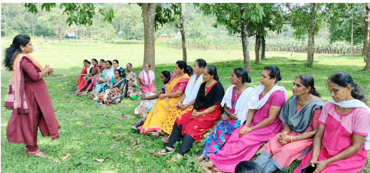
Training for women farmers at Wayanad district