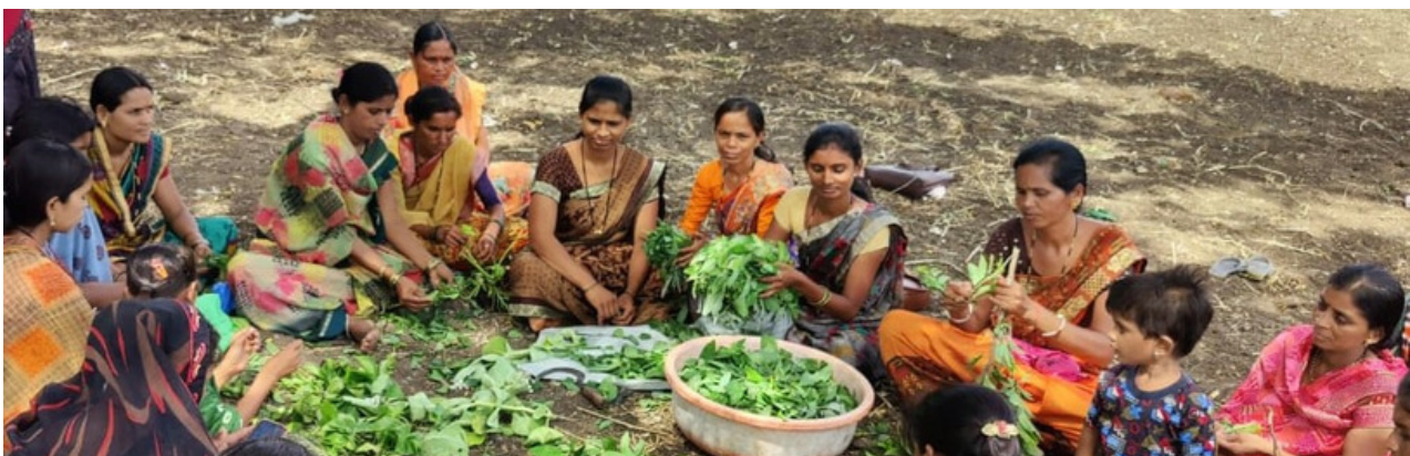
Training for women farmers on one-acre model farming at Nanded