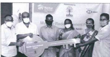
മുണ്ടാറിൽ ഹാബിറ്റാറ്റ് ഫോർ ഹ്യൂമാനിറ്റി ഇന്ത്യ എച്ച്.എസ്.ബി.സി.ബാങ്കിന്റെ സഹായത്തോടെ നിർമ്മിച്ച വീടുകളുടെ താക്കോൽദാനം നടത്തിയ ചിത്രം

വൈക്കം കോളത്തിൽ നിന്നുണ്ടായ പ്രളയം പ്രളയം ഉണ്ടായതിനുശേഷം മുണ്ടാർ ഗ്രാമത്തിലെ കുടുംബങ്ങൾക്കുവേണ്ടി എച്ച്.എസ്.ബി.സി.ബാങ്കിന്റെ സഹായത്തോടെ ഹാബിറ്റാറ്റ് ഫോർ ഹ്യൂമാനിറ്റി ഇന്ത്യ പണിത വീടുകളുടെ കൈമാറ്റം പൂർത്തിയായി. 2018-ലുണ്ടായ പ്രളയക്കെടുതിയിൽ ഭവനരഹിതരായവർക്കാണ് വീട് നൽകിയത്. ശതമാന സൗകര്യവും ദുരന്ത പ്രതിരോധശേഷിയുള്ള പൂർത്തായി നിർമ്മിച്ച 26 വീടുകൾകൂടി ബുധനാഴ്ച കൈമാറി.