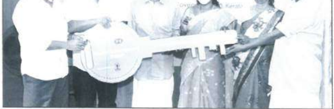
മുണ്ടാറിൽ ഹാബിറ്റാറ്റ് ഫോർ ഹ്യൂമാനിറ്റി ഇന്ത്യ എച്ച്.എസ്.ബി.സി.ബാങ്കിന്റെ സഹായത്തോടെ നിർമ്മിച്ച വീടുകളുടെ താക്കോൽദാനം നടത്തിയ ചിത്രം

കോട്ടയം കേരളത്തിൽ 2018ൽ ഉണ്ടായ ശ്രദ്ധേയമായ പ്രളയക്കെടുതിയിൽ ഭവനരഹിതരായ മുണ്ടാർ ഗ്രാമത്തിലെ കുടുംബങ്ങൾക്കുവേണ്ടി എച്ച്.എസ്.ബി.സി.ബാങ്കിന്റെ സഹായത്തോടെ ഹാബിറ്റാറ്റ് ഫോർ ഹ്യൂമാനിറ്റി ഇന്ത്യ പണി കഴിച്ച വീടുകളുടെ കൈമാറ്റം പൂർത്തിയായി. 2018-ലുണ്ടായ പ്രളയക്കെടുതിയിൽ ഭവനരഹിതരായവർക്കാണ് വീട് നൽകിയത്. ശതമാന സൗകര്യവും ദുരന്ത പ്രതിരോധശേഷിയുള്ള പൂർത്തായി നിർമ്മിച്ച 26 വീടുകൾകൂടി ബുധനാഴ്ച കൈമാറി.