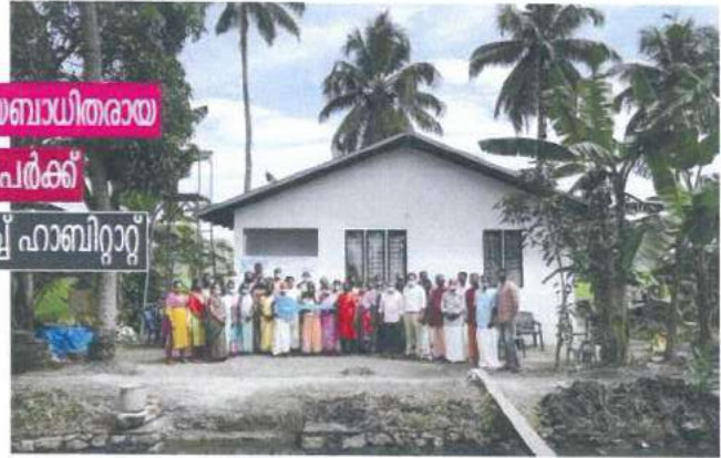
മുണ്ടാരിൽ ഹാബിറ്റാറ്റ് ഫോർ ഹ്യൂമാനിറ്റി ഇന്ത്യ എച്ച്.എസ്.ബി.സി ബാങ്കിന്റെ സഹായത്തോടെ നിർമ്മിച്ച വീടുകളുടെ താക്കോൽദാന ചടങ്ങ്.

കോർപറേറ്റ് ഫണ്ട് ഉപയോഗിച്ച് സന്നദ്ധ പ്രവർത്തനം