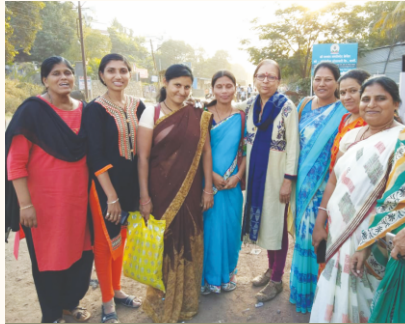
Sakhis for lifetime