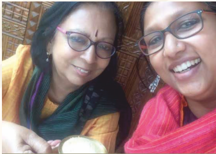
Filter coffee and unending chats