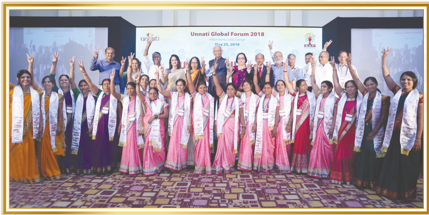
Women leaders at the Unnati Fellowship Award, 2018 for Women Changemakers