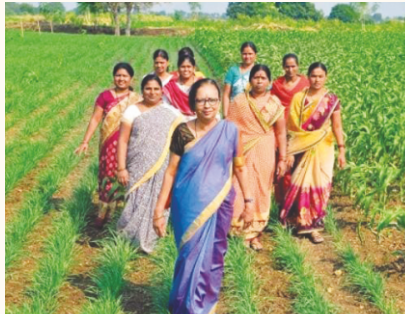
Always leading from the front