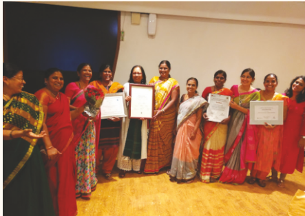
SSP's 20 years celebrations