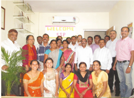
With SSP team at Pune office