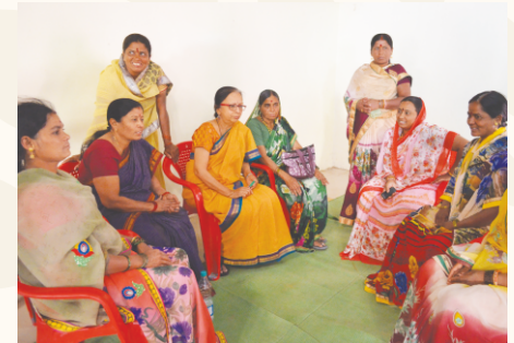
Grassroot women leaders in Maharashtra