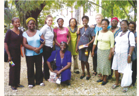
Friends from Haiti