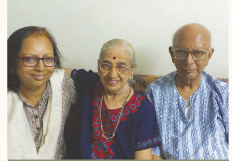
Her inspiring and supportive parents