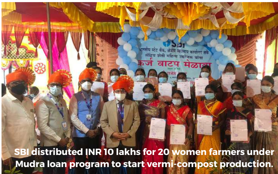
SBI distributed INR 10 lakhs for 20 women farmers under Mudra loan program to start vermi-compost production.

COVID response projects implemented by SSP since last year have helped local communities mitigate suffering and financial turbulence by provision of medical aid, food supply, cash assistance, house repair, livelihood recovery support etc.