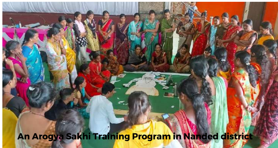
An Arogya Sakhi Training Program in Nanded district