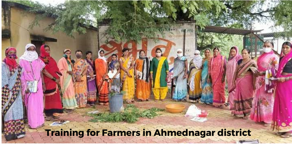
Training for Farmers in Ahmednagar district