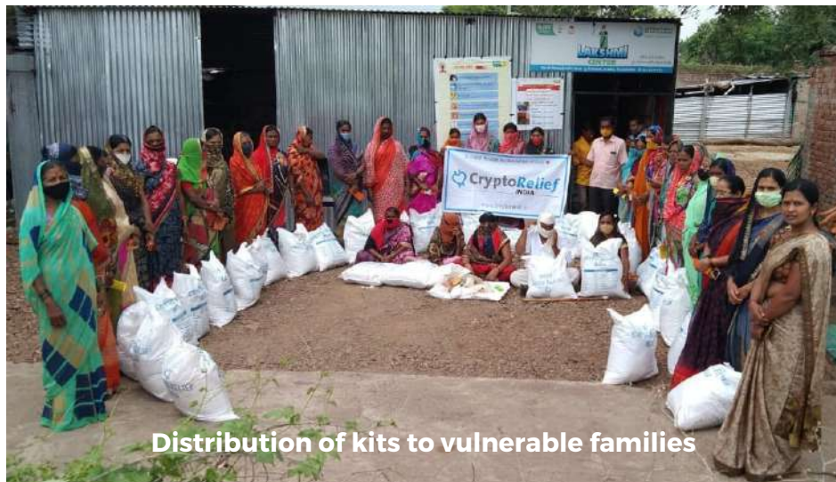
Distribution of kits to vulnerable families

A survey was conducted by women leaders and SSP team in August 2021 to identify poor and vulnerable families for food kit distribution in Maharashtra. Priority was women headed households, widows, single women, differently abled and migrant families. We verified this list with Gram Panchayats and finalized the selection. With the support of Kaushalya Foundation Smiles for All, selected families have received food kits/grocery to address the immediate need. In August and September, 135 families supported.