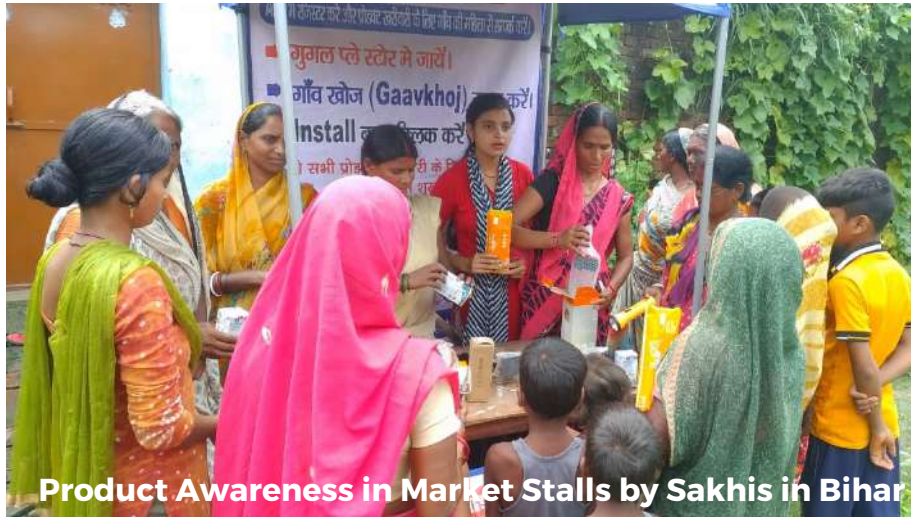
Product Awareness in Market Stalls by Sakhis in Bihar