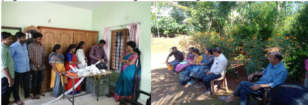
Key Partners: Habitat for Humanity India, Huairou Commission, Merrimac Middle East