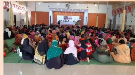
Mahila Melava at Osmanabad