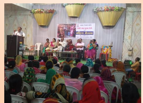
Mahila Melava at Latur