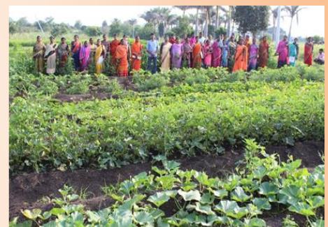
National Farmers Day celebration