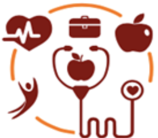
Water, Sanitation, Health & Hygiene