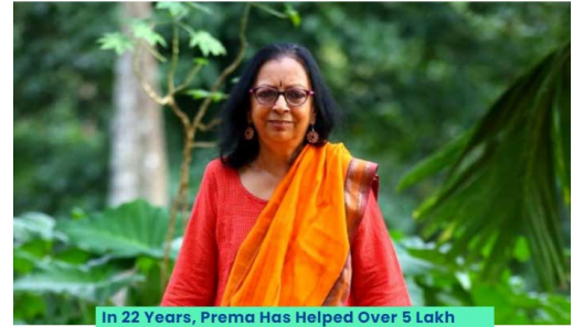
In 22 Years, Prema Has Helped Over 5 Lakh Women Become Organic Farmers, Mentors

“These women were stuck in the daily rigmarole of managing the kitchen, kids and the household. But now they were emerging as faces of a widespread change.” https://www.thebetterindia.com/218547/prema-gopalan-rural-women-empowerment-maharashtra-organic-farming-entrepreneurs-womens-day-say143/ (March 05, 2020)