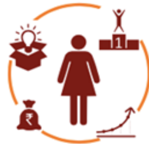
Women's Entrepreneurship & Leadership