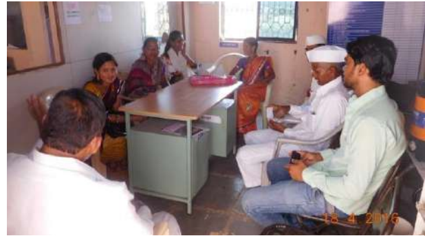
Gram Panchayat and community members meeting in Shinde

Since 2015, SSP is working on identifying major problems/challenges and implementing appropriate solutions around sanitation, health and livelihood opportunities for women across Vasuli and Shinde Villages. SSP with its expertise in the field of rural development particularly in terms of empowering women as entrepreneurs and as community change makers, proposed probable interventions to overcome the challenges in health, sanitation and livelihoods generation through empowering community women and other members in Vasuli and Shinde.